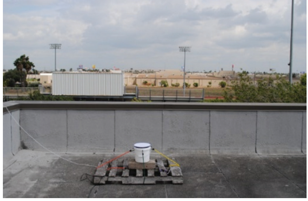
Figure 2. Old Bird 21c microphone located on the roof of HHSS in spring 2012.

To extract BAWW nfcs from the all-night audio, we ran Tseep software (Old Bird, Ithaca, NY) either in real-time (2012) or later on the recorded 9-hr audio files to automatically extract short transient sounds in the 6-10 kHz frequency band. WRE then visually analyzed spectrograms of the short clips using GlassOFire software (Old Bird, Ithaca, NY) to separate avian nfcs from non-calls, and to manually classify nfcs to species categories. The GlassOFire spectrograms were computed with a 128-sample Hamming window, a hop size of 1